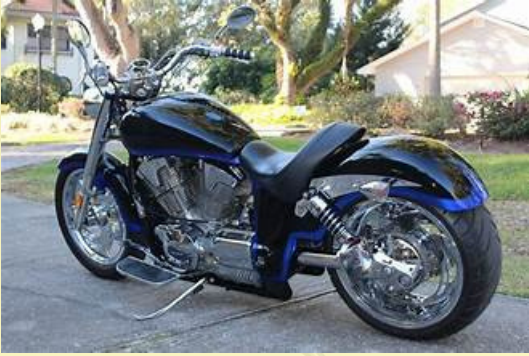
Honda VTX 1300