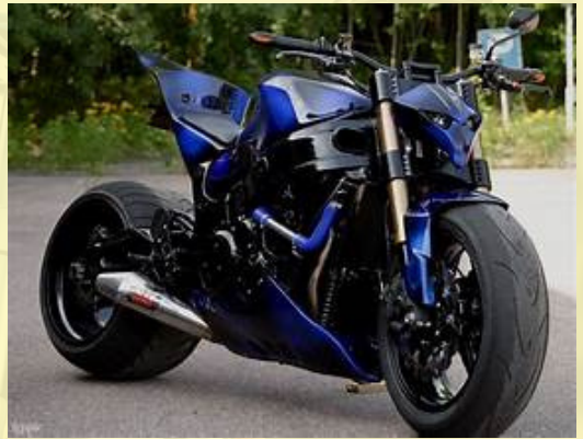
Hayabusa GSX 1300R